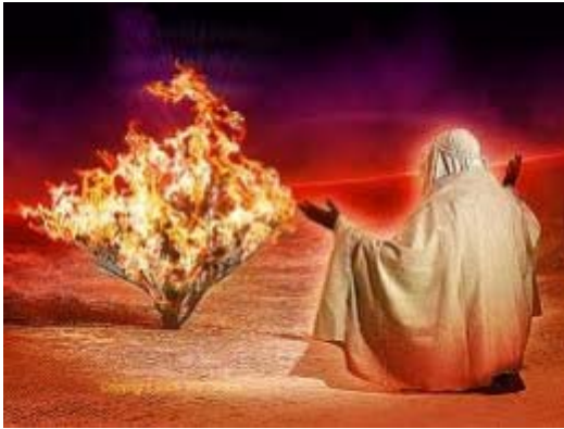
Moses at the burning bush

“And God said unto Moses, I AM THAT I AM: and he said, Thus shalt thou say unto the children of Israel, I AM hath sent me unto you.” Exodus 3:14