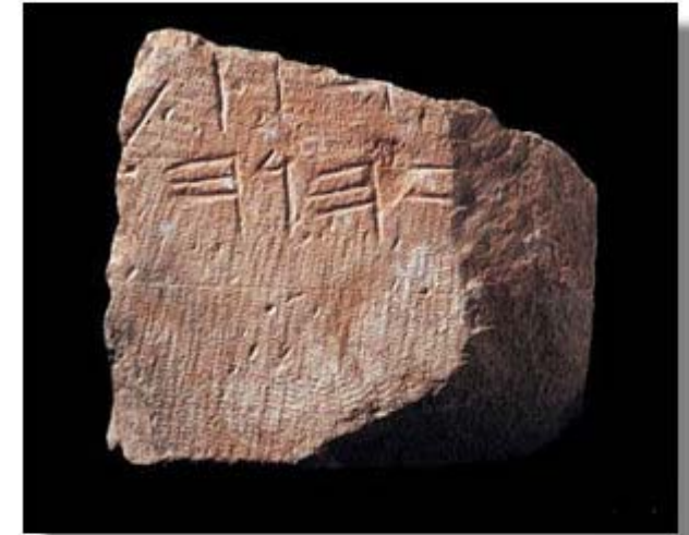
Paleo-Hebrew YHWH on stone