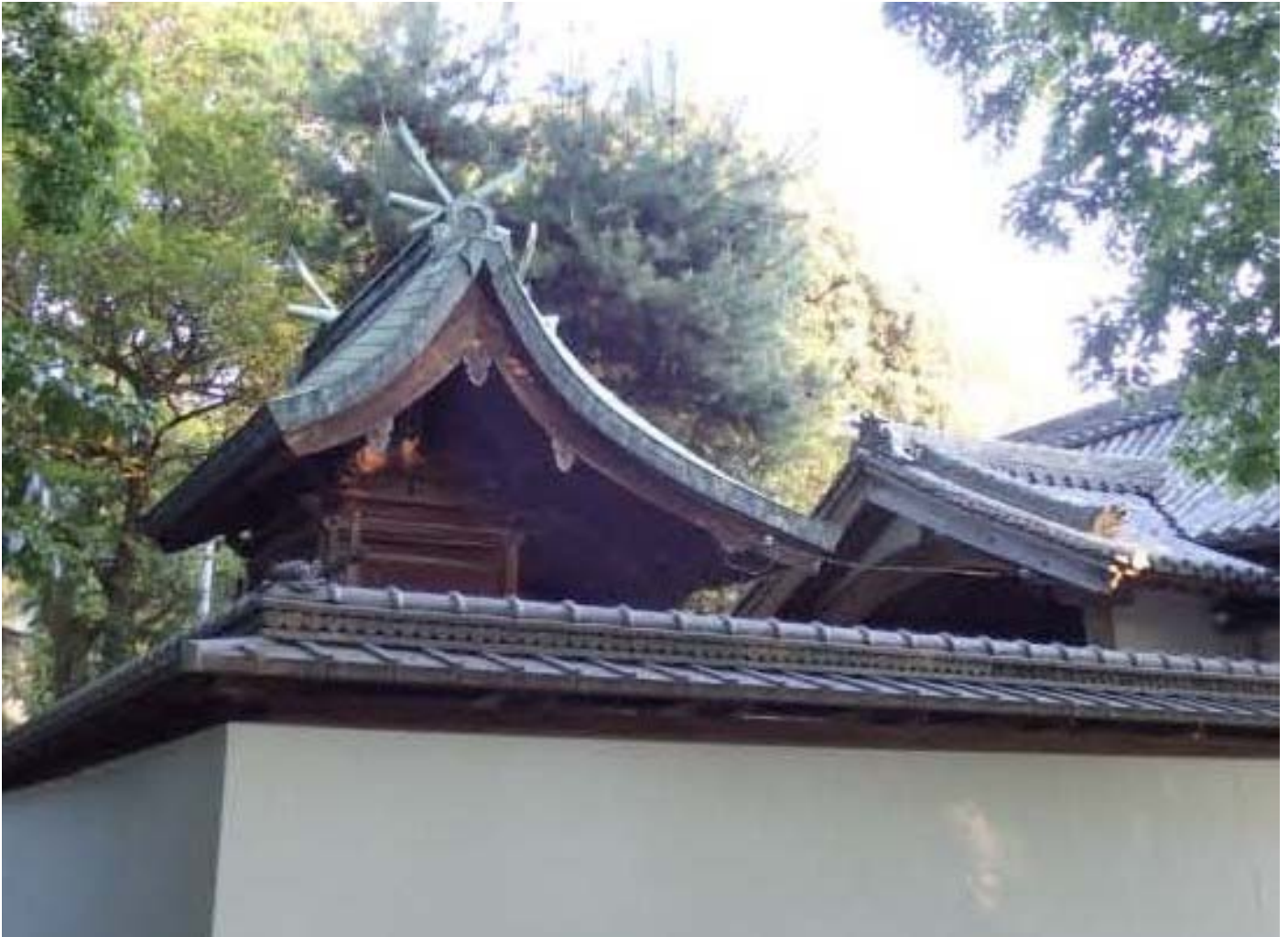
Figure 6: Honden (The building on the left). Do the two 'V' type bars called 'Chigi' on the roof look similar to the cherubim's wings? Exodus 25:18-20

When the people heard the thunder and saw the lightning and the smoking mountain, they trembled with fear and stood a long way off. (Exodus 20:18)