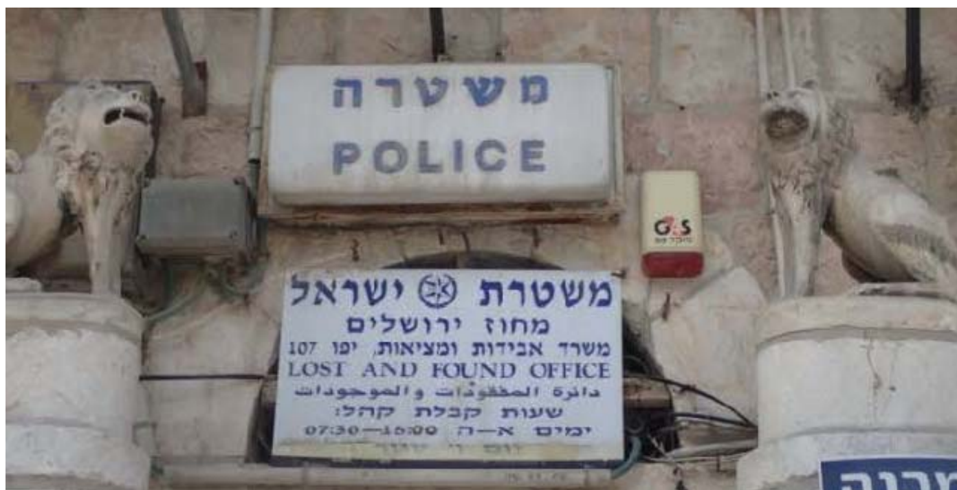
Figure 8: Lions made from stone, in Jerusalem.

I am Alpha and Omega, the beginning and the ending, says the Lord, which is, and which was, and which is to come, the Almighty. ... I am Alpha and Omega, the beginning and the end. I will give unto him that is athirst of the fountain of the water of life freely. ... I am the first and the last, the beginning and the end. (Revelation 1:8; 21:6; 22:13)