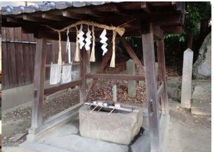
Figure 4: Temizuya