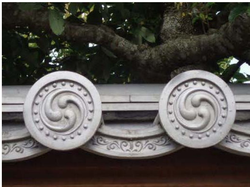
Figure 9: Design of the roof tiles.

Fig. 10 compares the structures of Israel's Tabernacle and Shinto shrines. There are remarkable resemblances between the two. However, there is just one difference; Shinto shrines do not have altars for animal sacrifices. What could be a possible reason? The Old Testament tells us that God designated only one place for animal sacrifices: