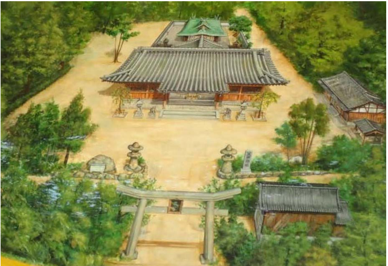
Figure 2: A bird's eye view of Amada Shrine. Painting by Tetsuya Kayahara. Supervised by Norio Inoue.