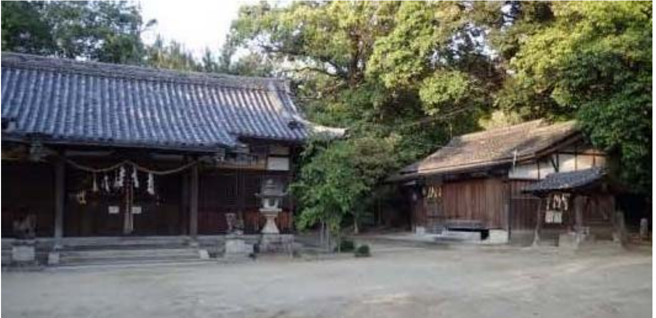
Figure 1: Front garden of the Amada Shrine

When I was a young child, I used to play on Shinto shrine grounds. I went there to catch cicadas in summer and gather nuts in autumn, in the thick woods surrounding the shrine buildings. I became a Christian in 1989, and since then have seldom gone to Shinto shrines. However, I happened to enter the grounds of a shrine in April 2016, when I was hiking down a mountain. Looking around, I was surprised, because I realized the structure of the shrine resembled Israel's tabernacle despite the fact that it looked very Japanese.