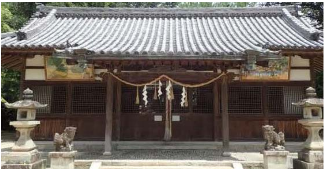
Figure 5: A 'Shimenawa' rope is hung at the front. An offering box is set behind the grid. Zechariah 11:13, Mark 12:43.

Another curtain and also a rope called 'Shimenawa' are equipped in front of the Haiden. A grid is used instead of a curtain for this shrine, see Fig. 5.