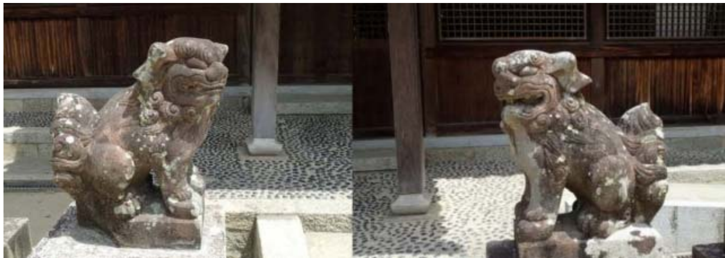
Figure 7(a) left and 7(b) right: Komainu

It is interesting that a pair of animals made of stone called 'Komainu' face each other at the entrance of the Haiden (Figs 7(a) and 7(b)). Japanese people say they are dogs. But, to all appearances, they are lions. The animal on the right opens its mouth to say 'ア=A' and the other, on the left, closes its mouth to say 'ン=N'. 'ア' and 'ン' are the first and the last characters of the Japanese alphabet, just like 'α' and 'ω' are the first and last of the Greek alphabet.